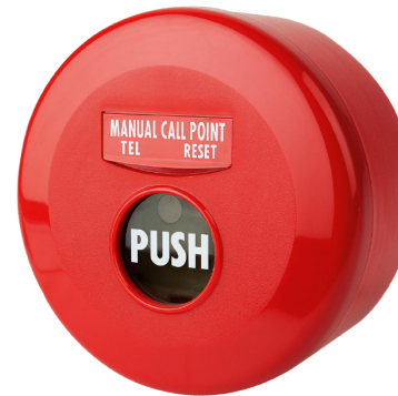
D Manual Station